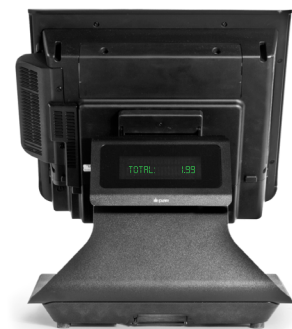
2x20 VFD Display