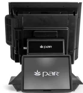
5x7" Card Holder